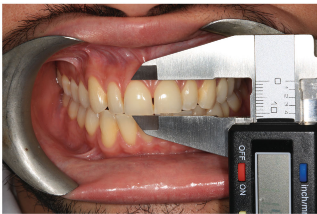
Figure 1. Clinical crown height measurement from gingival margin to incisal edge with a digital calliper.

The validity of the clinical crown height module could be improved if reference values are defined by tooth group (using the recommended clinical technique), if they are expressed as percentiles and if the factors related to crown height are considered. The primary aim of this study was to establish reference values for the clinical crown height of anterior teeth and canines, as measured using a clinical technique and expressed as percentiles and by sexual dimorphism. This study also aimed to determine whether the body height and the side affected the reference values for the clinical crown heights of each tooth group.